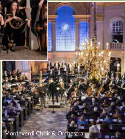
Monteverdi Choir &amp; Orchestra