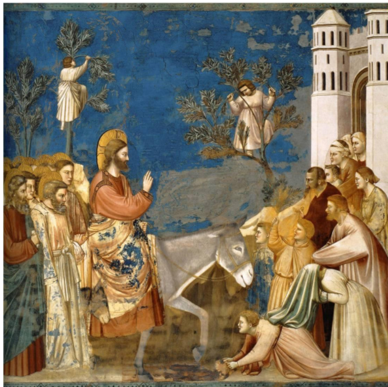
Christ entering Jerusalem, Giotto, Scrovegni Chapel, Padua